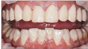
Temps Retracted View-Open