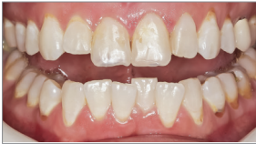
Pre-Op Retracted View-Open