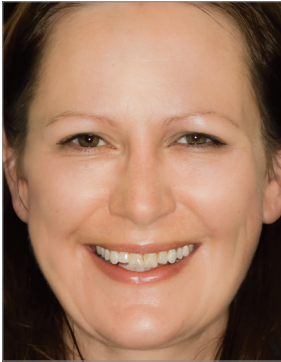
FULL FACE (Pre-Op Lip Line)