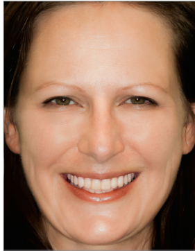
FULL FACE (Temps Lip Line)