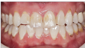
Pre-Op Retracted View-Closed