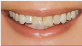
REPOSE (Pre-Op Lip Line)